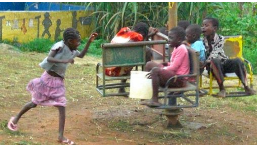
Overcrowded: Children from the Home and the surrounding villages playing.

Needed: £2995 to extend and repair the playground.