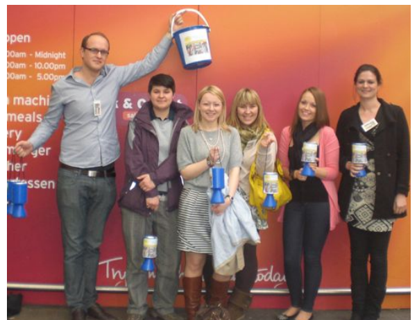
Some of the bag packing volunteers